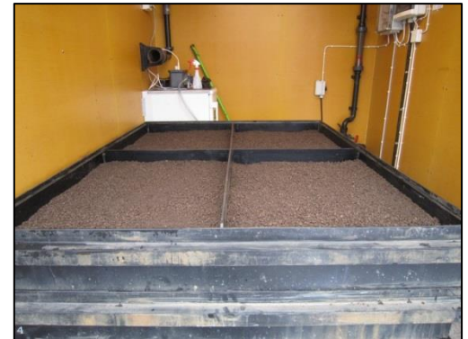
Aboveground Container-Housed Filter with Fresh Peat